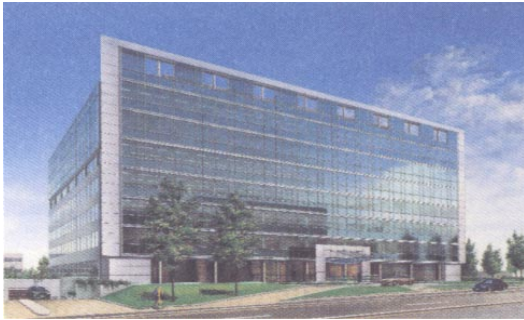
Diamant Building, Bd. A. Reyers 80, B-1030 Brussels